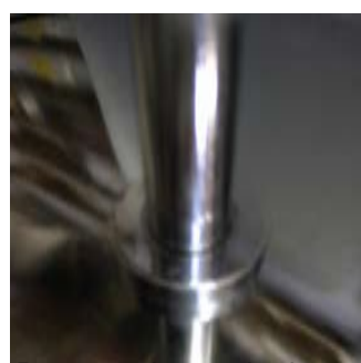
Bottom pole attached to Weighted Base, sitting in pole support, and screwed in using Large Allen wrench