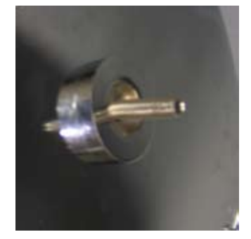
Topside of Weighted Base, with Bolt threaded through 2" Pole Support (tilted to the side)