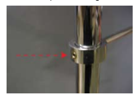
Use Small Allen wrench to tighten

3. Slide Spiral Curve with attached short rods over Long (top pole) and adjust height where necessary. Secure into place using Small Allen wrench.